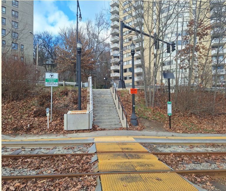
Current Fairbanks T Stop 18 stairs