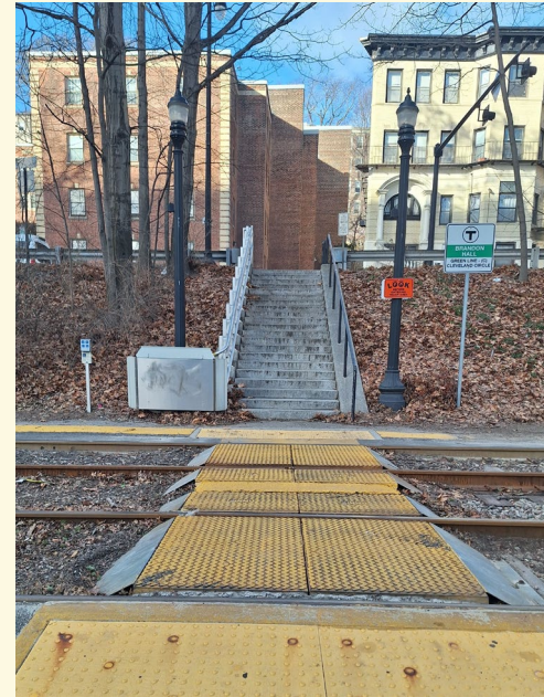
Current Brandon Hall T Stop 20 stairs